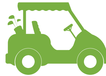
Using your golf cart