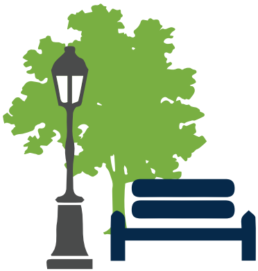
Relaxing on a nice day