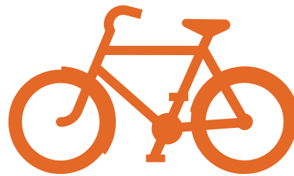
Riding your bike